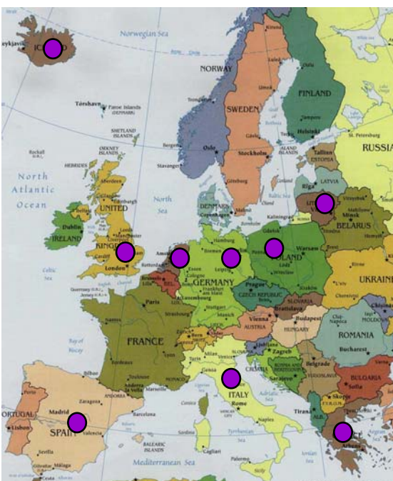
Countries in the newborn study

More than 8500 newborns from 9 different countries in Europe will participate in a study that will investigate the occurrence of food allergies in the first 2½ years of life. The researchers will interview the mothers regularly. They will conduct allergy testing if a child shows symptoms of a possible food-related allergy. The 9 different countries participating in the study cover a range of different cultures and climates. The researchers will see if the occurrence of food allergy is the same in all countries. If differences do exist the researchers will explore whether the differences can be explained by, for example, different eating habits or pollen exposure. The EuroPrevall study with newborns is the most comprehensive investigation of food allergies in the first years of life to date.